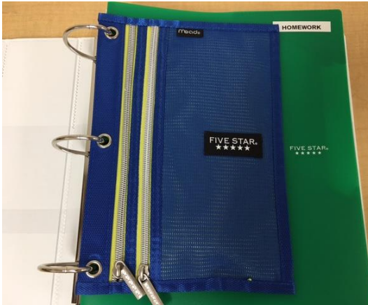
Two-pocket pencil holder for binder