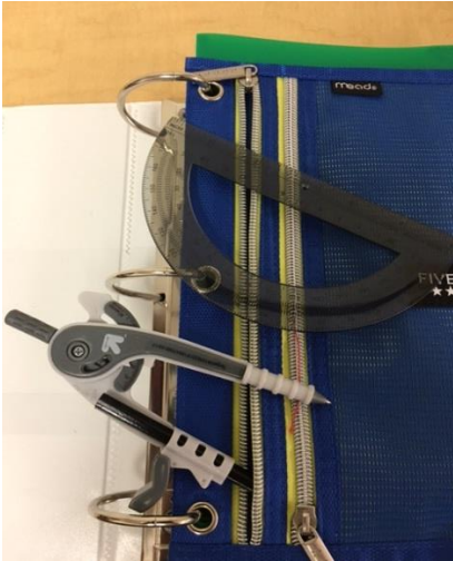
Compass and Protractor