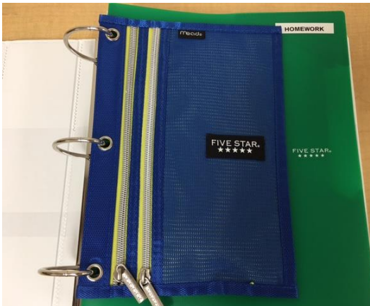
Two-pocket pencil holder for binder