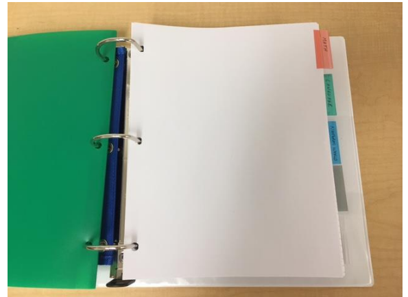
Tab subject dividers